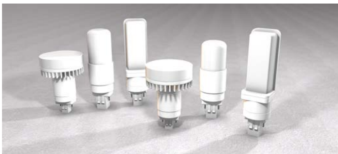
PIN BASE LAMPS